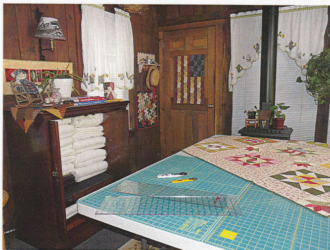
Cutting Area. I have converted a heated porch to serve as my cutting room. It has two large tables and cutting mats, and I store my batting in a cabinet that used to house a television, before days of flat screen TVs. Its large windows and skylights make it a perfect space to photograph customers' quilts.