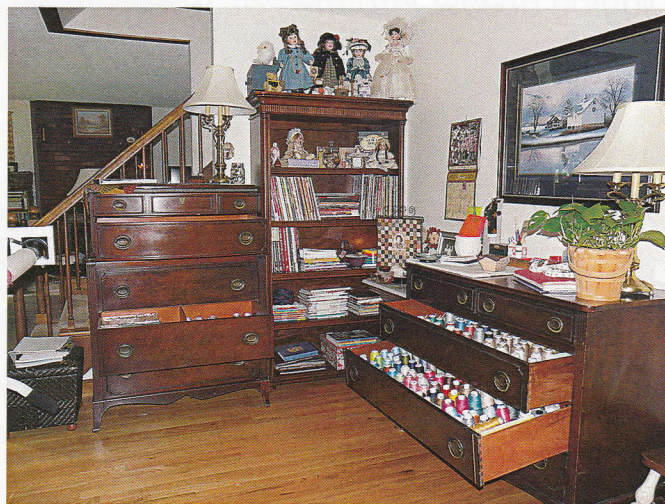
Storage Area. I store my pantographs, magazines and thread in my mother's vintage bedroom chests. My quilting books and magazines are in the bookcase along with my mother's doll collection. She passed away three years ago and I treasure her collection.